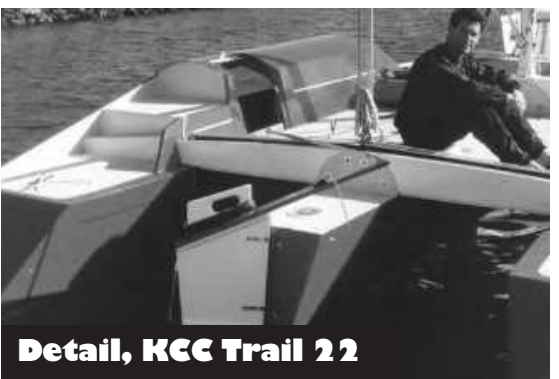
Detail, KCC Trail 22