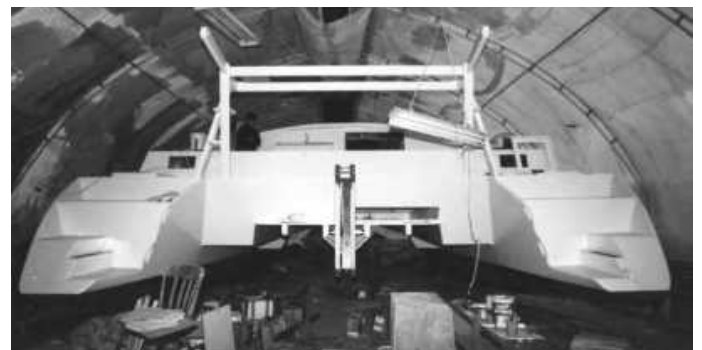
Glasby family's KCC 44 nears completion in a garden igloo