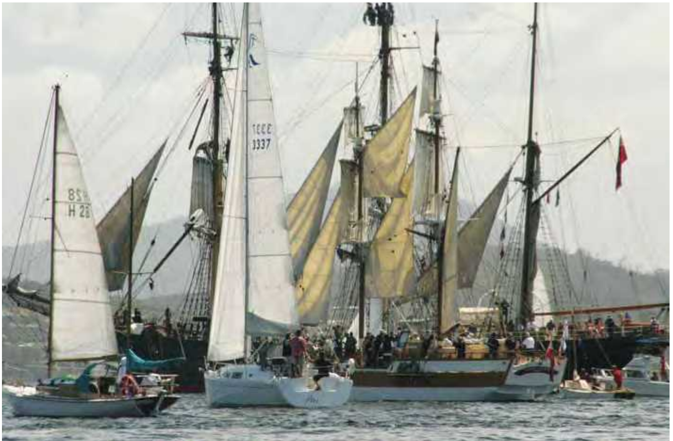
Heavy duty historic tugs, ferries and a brace of square riggers, make this the heavy duty Wooden Boat Festival of Australia.